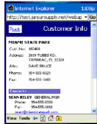
Pages reduced to download quickly and view easily on the Pocket PC

For more information about Activant's solutions and services, visit www.activant.com , e-mail distribution@activant.com or call 1-800-776-7438, press 1.