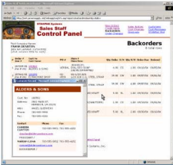
Status of Backorders and Customer Contacts